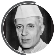
Late Pandit Jawaharlal Nehru