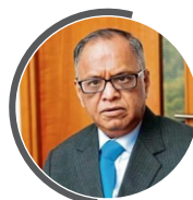
Shri N. R. Narayana Murthy