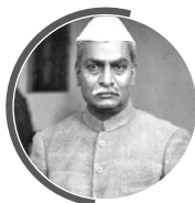
Late Dr. Rajendra Prasad