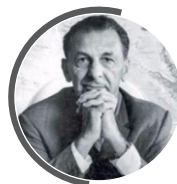
Late Shri J. R. D. Tata