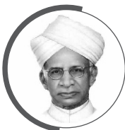
Late Dr. S. Radhakrishnan