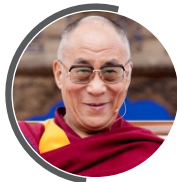
HH Dalai Lama