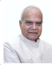
Vice-President SHRI BANWARILAL PUROHIT