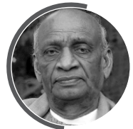
Late Sardar Vallabhbhai Patel