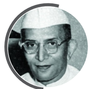
Late Shri Morarji Desai