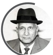
Late Shri G. D. Birla