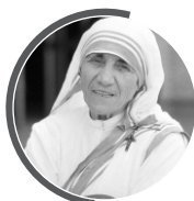
Late Rev. Mother Teresa